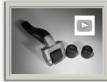
Retex Tools #1