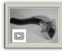
Retex Tools #2