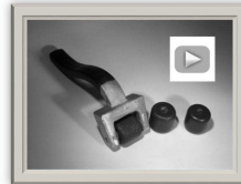
Retex Family #1