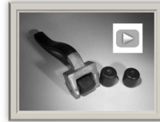
Retex Family #1