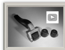
Retex Family #1