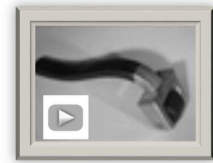
Retex Family #2