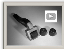
Retex Family #1